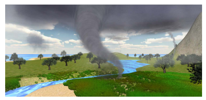
Fig. 5. The triggered weather phenomenon – a Tornado – is animated

After the weather animation, level and score are updated. The actual simulation model of Cloud Computing is based on a comprehensive database (derived from [12]), comprised of several rules that link the adjustable weather parameters to (a) certain changes in the parameter settings themselves, (b) changes in the weather, and (c) emerging weather phenomena as a whole.