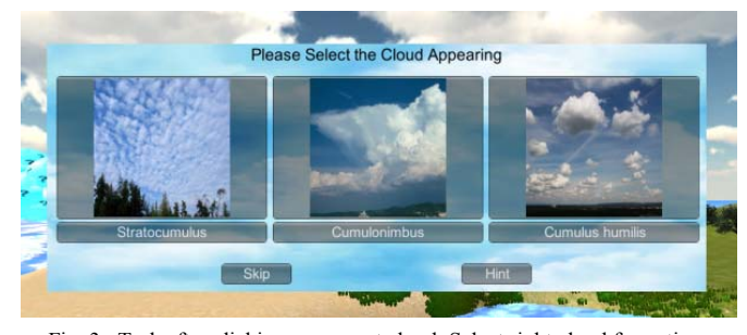
Fig. 3. Task after clicking on a quest cloud: Select right cloud formation according to the weather phenomena

At that point, a hint may be given to continue. After this task was solved successfully, the sliders have to be set to the right positions in order to start the animation of the weather phenomenon. When solving the quest, a GUI bar appears to the left (see Fig. 2a): It contains interactive and non-interactive elements. The first three labels from the top inform the user about the quest to be solved, including the points that can be achieved. The three buttons below have the following functions: By clicking "Create", the weather phenomenon is animated if the sliders were adjusted correctly. . If only one slider has the wrong settings, the desired weather phenomenon is not animated. An example is depicted in Fig. 5, where a tornado is created, Fig. 4 shows the correct settings for the tornado. Other weather phenomena are thunderstorms, winter storms, rain, hail, fog, tornados, and snow. By clicking the button "Hint", further explanations and instructions are shown. "Skip" abandons the currently active quest.