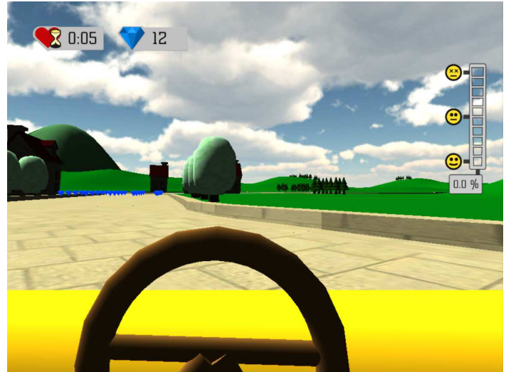
Fig. 1: Drink & Drive 's first-person default view is reduced to a simple steering wheel dashboard and a few icons that represent the time left to complete the track (the heart icon in the upper-left corner), the achieved score (the diamond icon next to the heart icon), and the alcohol blood concentration (to the right-hand side).

Since Drink & Drive is a driving simulation, the player takes control of a car and interacts through it with the world around him. The final result is represented by Figure 1. As Drink & Drive needs to appeal to a broad group of users and especially to the younger audience, the user interface has to be simple and provide precise feedback. For our first implementation, we decided on simple visuals and an automatic car, which can accelerate forward and backward, turn left and right, and break – all by pressing standard computer keys, i.e. the arrow