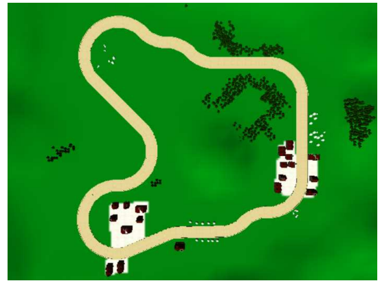
Fig. 5: The default track seen from above. The windings impose user interaction without pushing the challenge too far.

different conditions. The immersion is rounded off using an easy listening tune for the background music and brief, cartoonish sounds to underpin various user interactions such as picking up items.