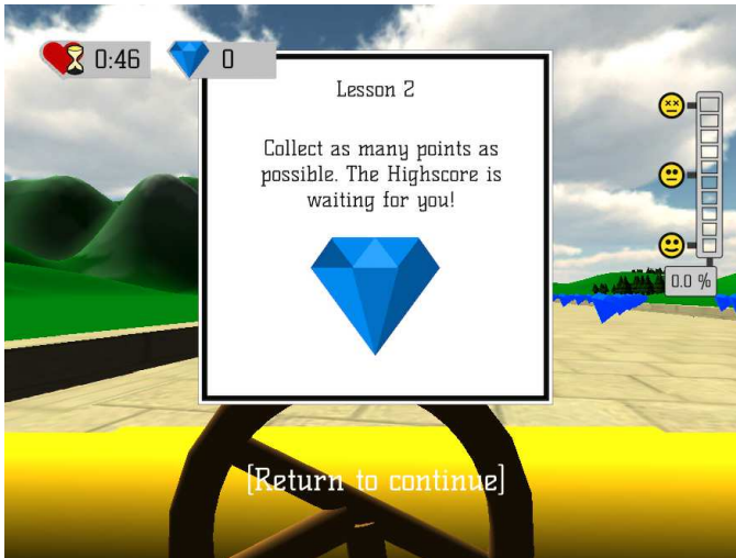
Fig. 3: A tutorial quickly steps through the game mechanics.

Therefore, some form of restriction had to be implemented. We decided to give the player a certain amount of time to complete one lap on the track. If he does, the timer is reset, otherwise the simulation ends. Similar to trendy endless runners and physics puzzlers such as Angry Birds, an infinite play is only prohibited by practical reason. As a result, there is always an incentive in returning to the simulation and in trying for a new high score.