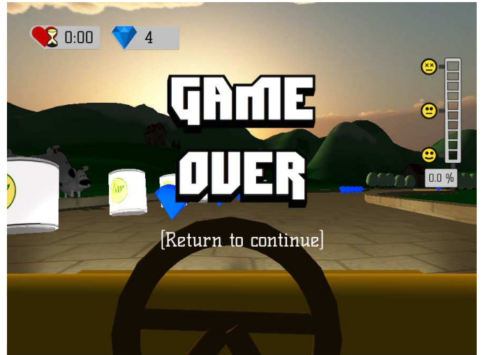
Fig. 4: We developed a trendy style to attract our young target audience (14 to 27 yrs).

To render Drink & Drive attractive for our target audience, we developed a flashy, eye popping style that we deployed consistently throughout the game, see for instance Figure 4. Simulating three different daytimes creates atmosphere and allows the user to experience the effects of high BAC under